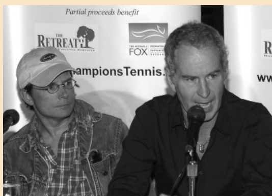
Michael J. Fox and John McEnroe at press conference for LTU Champions Trophy